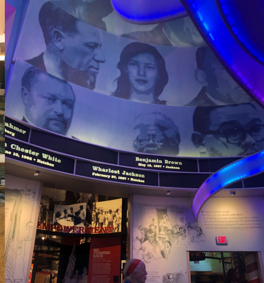
Freedom Rider Joan Trumpauer Mulholland